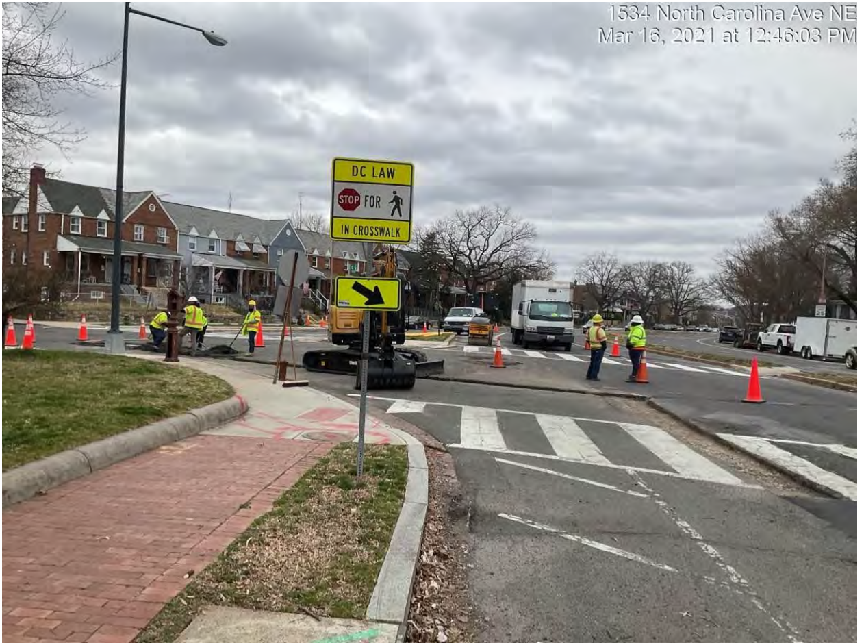
Picture No. 1: 03162021 – WGL relocation, C St NE & 16th looking east