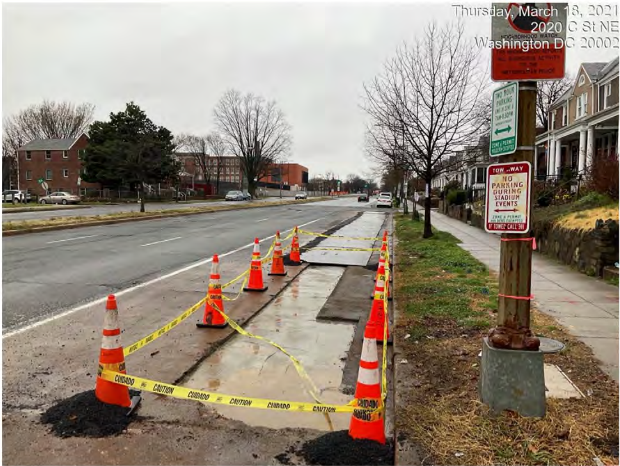
Picture No. 4 – 03182021 – Verizon relocation, C St NE at 20 th , looking west