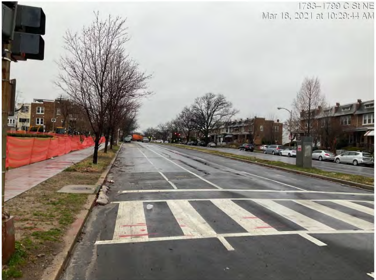
Picture No. 3 – 03182021 – Existing Conditions C St NE at 18 th , looking west