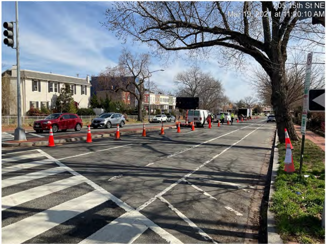
Picture No. 5 – 03192021 – WGL Services, C St NE at 15 th , looking east