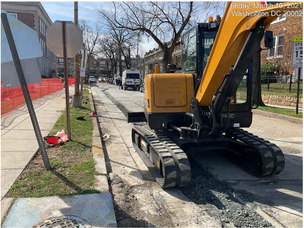
Picture No. 6 – 03192021 – Pavement restoration by Mighty Four, WGL sub, C St NE and 17 th St PI looking south