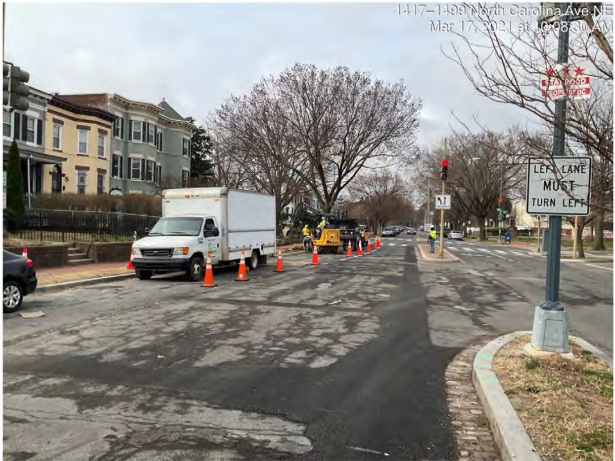
Picture No. 2: 03172021 – WGL Services C St NE at 14th, looking west